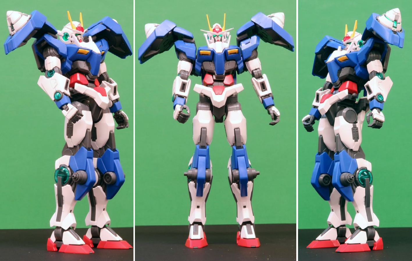
Lars Knowles's 1:100 scale 00 Gundam Seven Sword (Bandai Master Grade), a weapons pack/equipment variation for the GN-0000 00 Gundam that appears in the Mobile Suit Gundam 00V side story. The original Seven Sword System was designed specifically for the Gundam Exia, the close combat Gundam-type mobile suit featured in both seasons of Mobile Suit Gundam 00 . The unit is piloted by Setsuna F. Seiei.